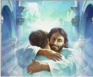
Sharing the great love of Jesus through the beauty of our Catholic faith