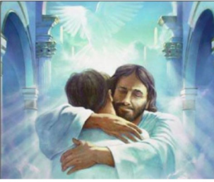
Sharing the great love of Jesus through the beauty of our Catholic faith