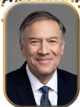
Featured Speaker Michael R. Pompeo

For Questions: Call 314-434-4900 or email mrl.eastern@yahoo.com