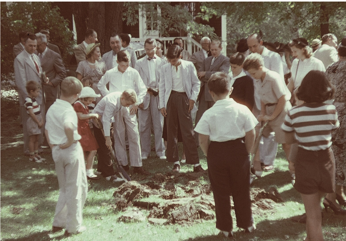
Groundbreaking for the new Annunziata Church; with the original home, that housed the Chapel, in the background.

In the coming weeks and months there will be opportunities to celebrate as a Parish Family.