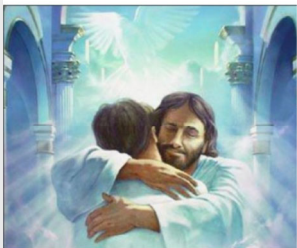
Sharing the great love of Jesus through the beauty of our Catholic faith

Just a Minute can bring us closer to Jesus